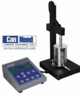
DER-4 Digital Enamel Rater