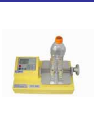
STT-100 / STT-100S Digital Torque Tester