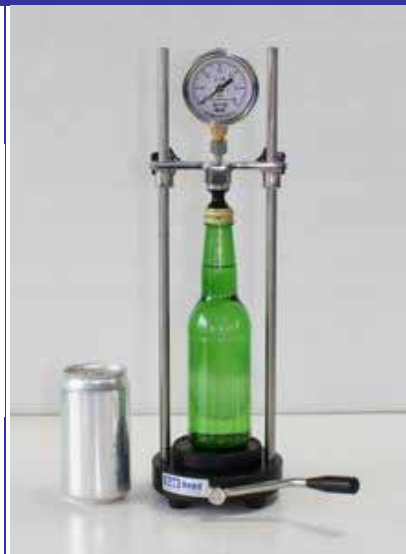
CAN-7001 CO2 Tester and Pressure Tester