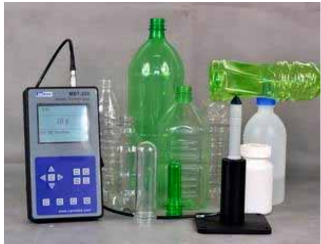
Plastic Bottle and Preform Measuring