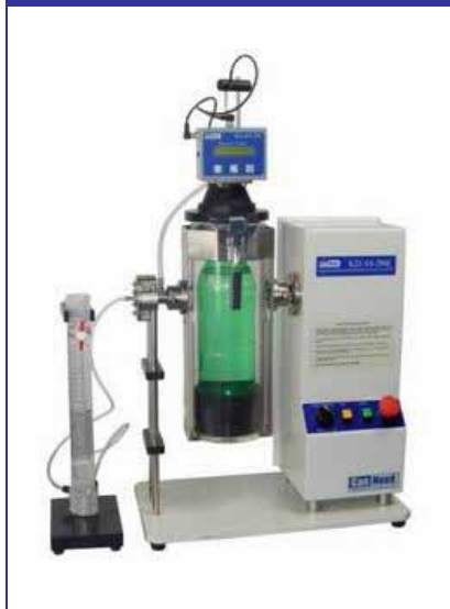
AS-200d Digital AutoShaker Beverage CO2 Calculator