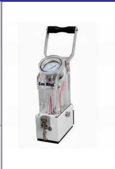
GMT-100 Portable Beverage CO2 Meter (CO2-Gehaltmeter)