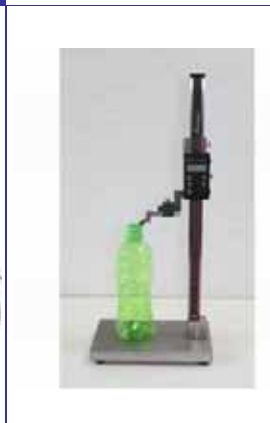
DHG-300 Digital Can Height Gauge

We have the excellence on: R&D, Service, Product Performance and Quality, and Customer Satisfactory