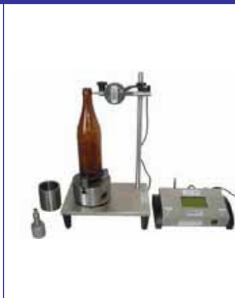
VAT-300 Perpendicularity Tester for Bottle (Auto)