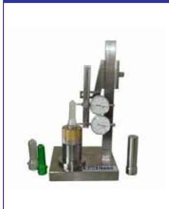
PPG-100, PPG-200 Preform Perpendicularity Gauge