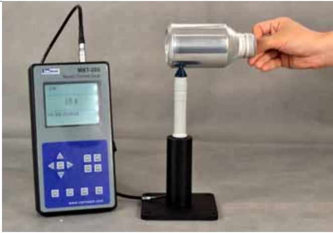
Aluminum Bottle Measuring