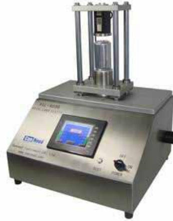
AXL-4000 Axial Load Tester