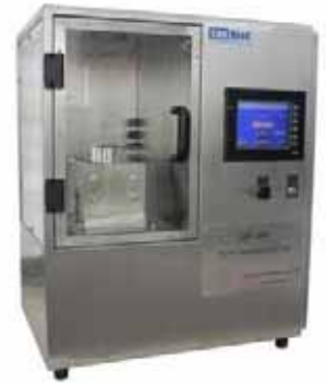
CBT-200 Buckle Tester Bottom for Can