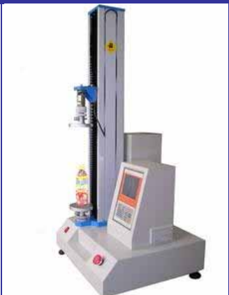
TLT-100 Top Load Tester