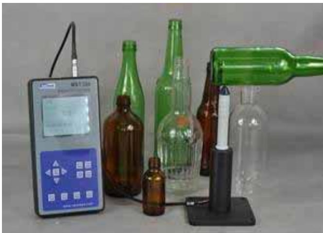
Glass Bottle Measuring

MBT-200 is based on the theory of Hall Effect. For test, place the steel ball on one side of the sample and the probe on the other side. The Hall Effect sensor on the probe measures the distance from the probe tip to the steel ball. The calculator will display the real thickness readings.